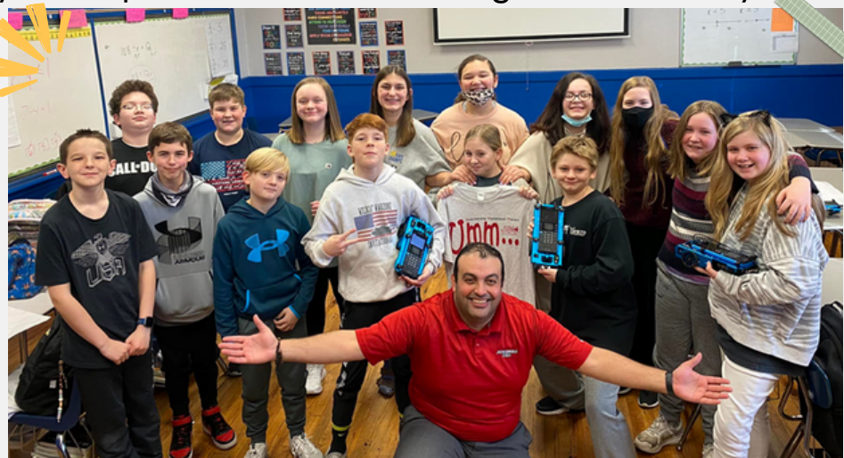
The Umm... program visiting Piedmont Middle School.